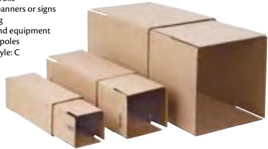
Priced per Box