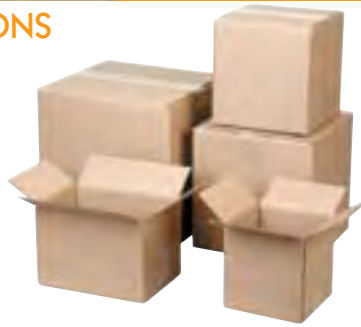
Priced per Box