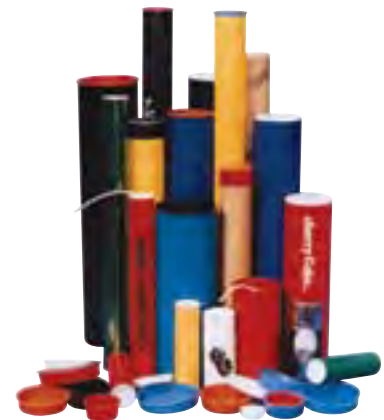
Priced per Tube