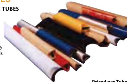
Priced per Tube