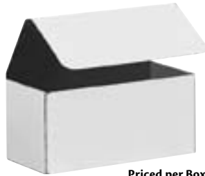
Priced per Box